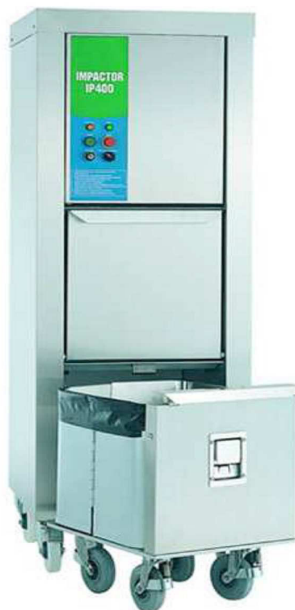
Food waste compactor / Abfallpresse IP600

Tel.: +49 40 600 094 680 E-Mail.: info@wesco-navy.de