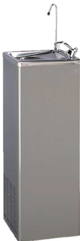
Drinking water cooler / Trinkwasserkühler DWCB50ABC