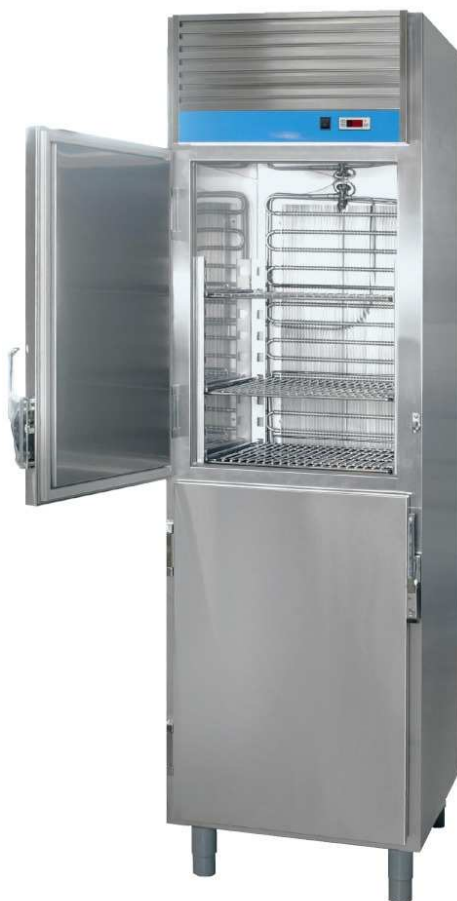
Refrigerator / Kühlschrank CK400T2

Tel.: +49 40 600 094 680 E-Mail.: info@wesco-navy.de