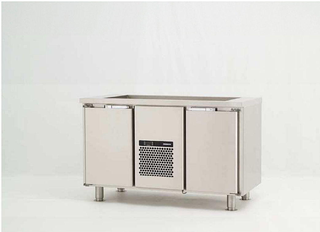
Picture is showing counter with space for 3GN

Refrigerated counter / Kühltresen CCP4/3GN