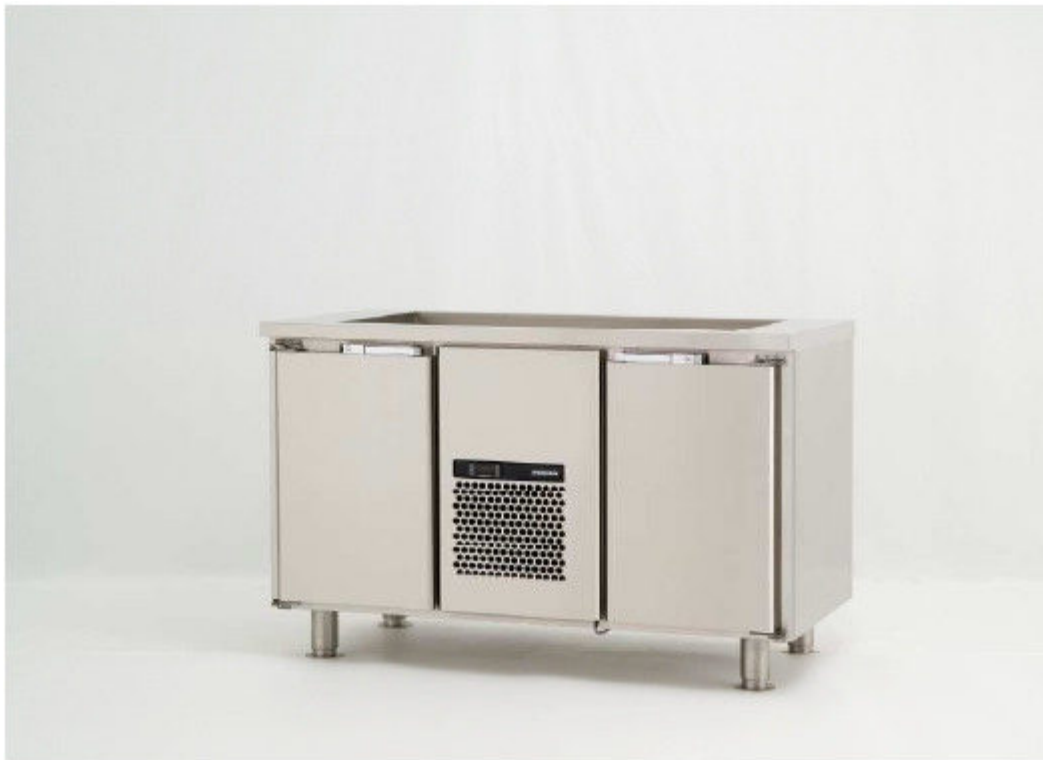
Refrigerated counter / Kühltesen CCP3GN

Tel.: +49 40 600 094 680 E-Mail.: info@wesco-navy.de